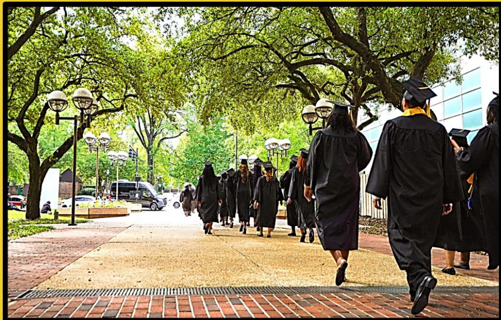
MILES COLLEGE GRADUATING CLASS OF 2023