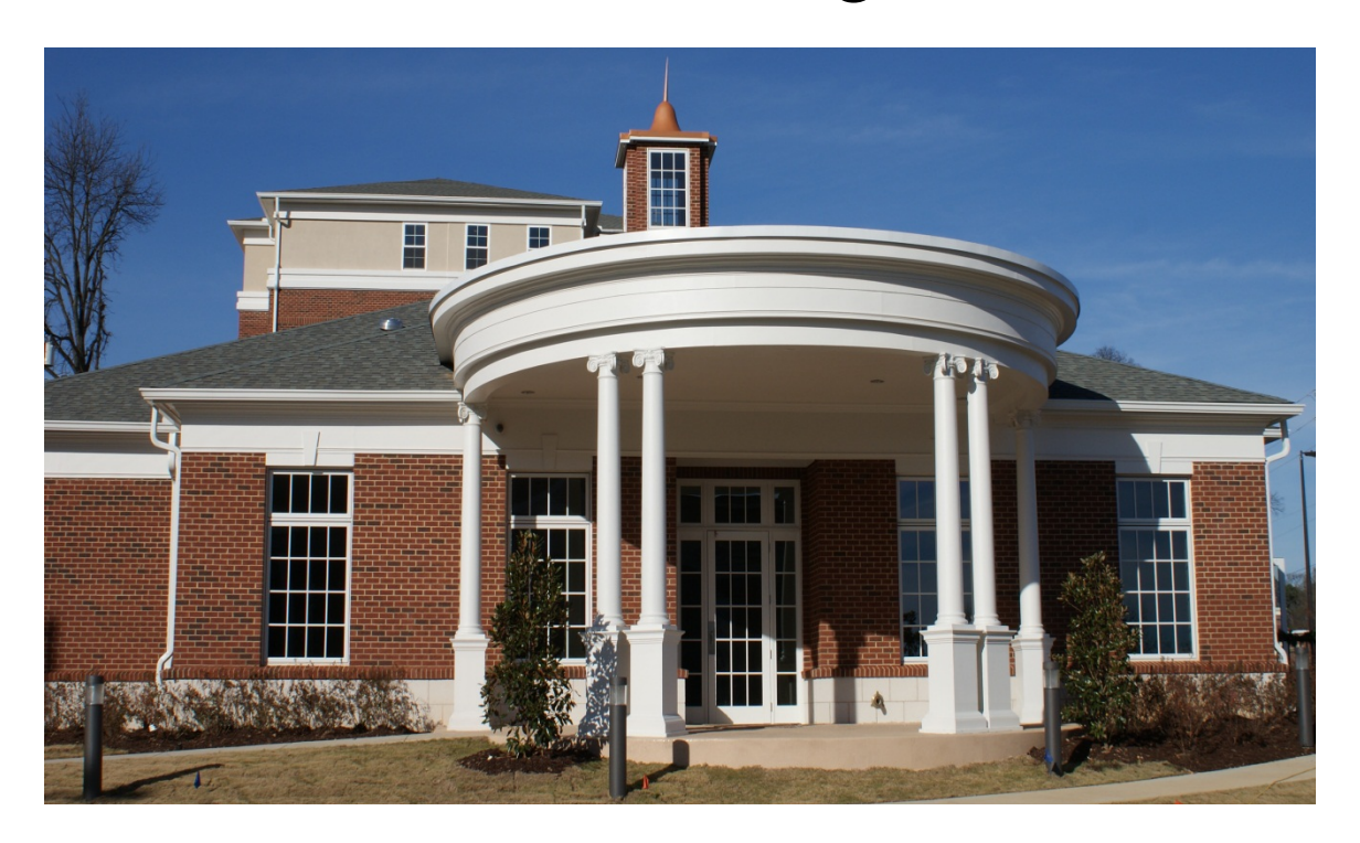
2017 Annual Report

Annual Campus Security and Fire Safety Report